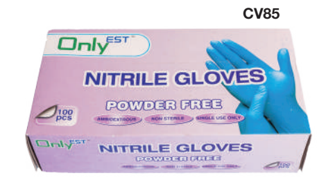
Powder FREE Nitrile Gloves 100 per pack, Hospital Standard (Small, Medium, Large) (Single)