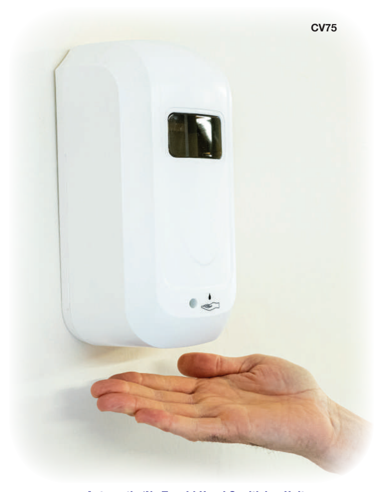
Automatic 'No Touch' Hand Sanitising Unit