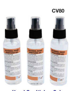
Hand Sanitising Gel 100ml Bottles (Box of 25)