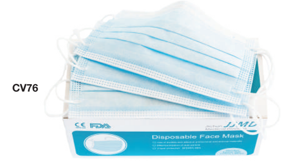
Medical Standard Face Masks with Nose Punch (50 per box)