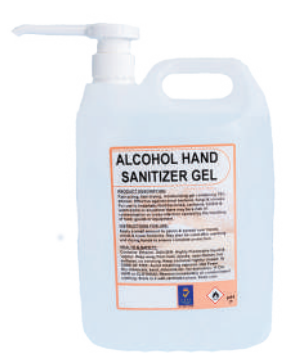
CV77 Alcohol Hand Sanitiser Gel: 5litre with Hand Pump for Refilling Smaller Containers (Box of 4)