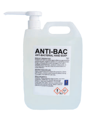
CV78 Anti-Bac Hand Soap: 5litre with Hand Pump for Refilling Smaller Containers (Box of 4)