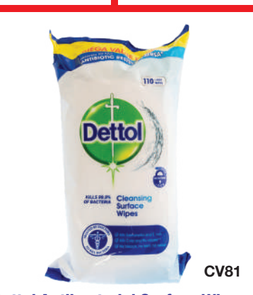
Dettol Antibacterial Surface Wipes (110 per pack | Box of 10)